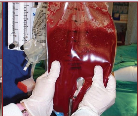
Finished Product Concentrated in 8 - 10 Minutes